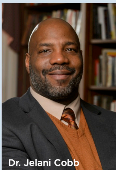
Dr. Jelani Cobb

Please join us Wednesday, January 27 for a virtual pre-Symposium lunch to discuss our theme