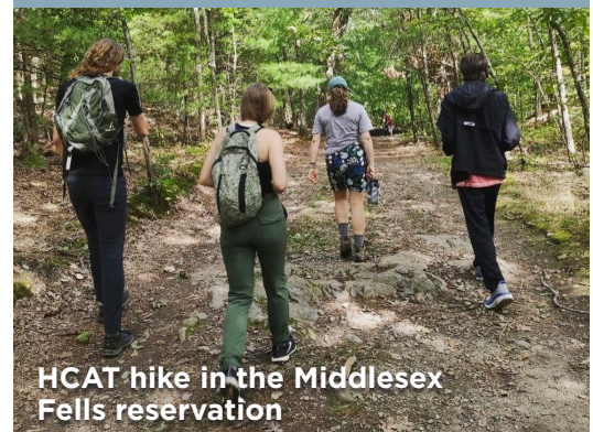
HCAT hike in the Middlesex Fells reservation