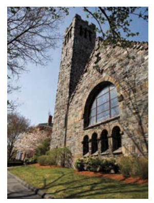
Goddard Chapel 3 The Green