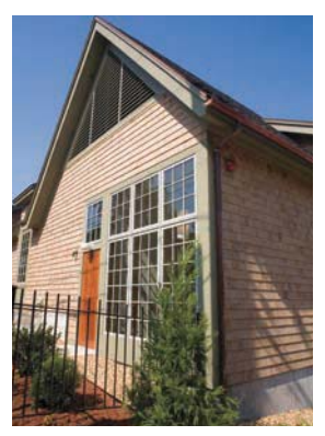
Interfaith Center 58 Winthrop Street