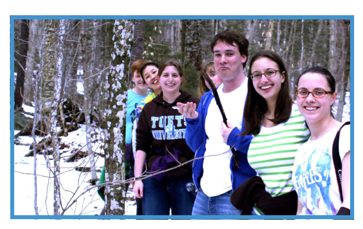
Nonreligious community members gather at the Lodge in 2013.

One-fifth of the U.S. public and one-third of U.S. adults under the age of 30 consider themselves to be "religiously unaffiliated," or nonreligious. This broad and growing group has come to be known sometimes as the Nones, which comes from the observation that more and more people checked the "None" box when asked to identify their religious orientation in various surveys. or those who might check the "None" box on a spiritual identification survey. This is a very diverse group: those who check the "None" box might have been raised religious or never ex-