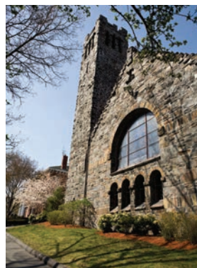
Goddard Chapel 3 The Green