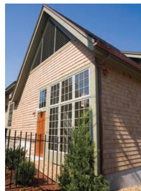
Interfaith Center 58 Winthrop Street