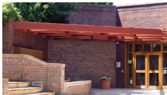
Granoff Family Hillel Center 220 Packard Avenue